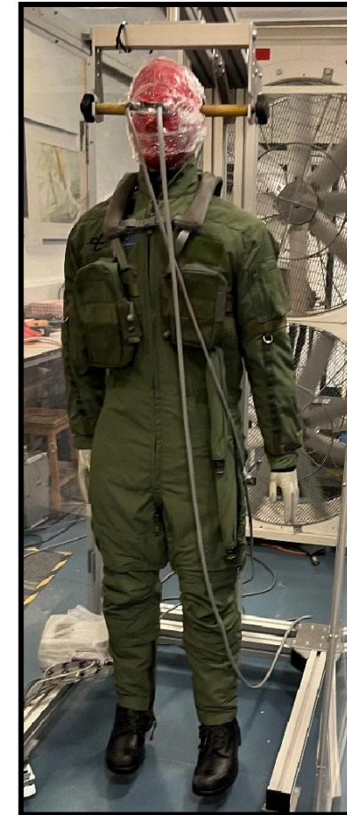
Atheris integrated to the copper manikin