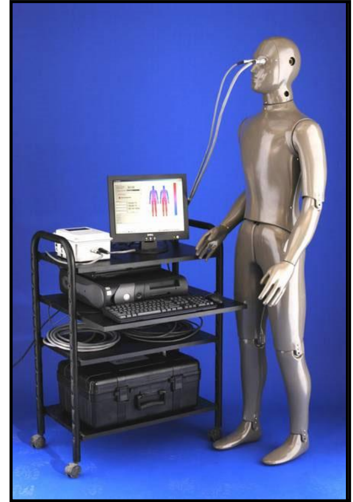
Thermal Manikin "Newton"